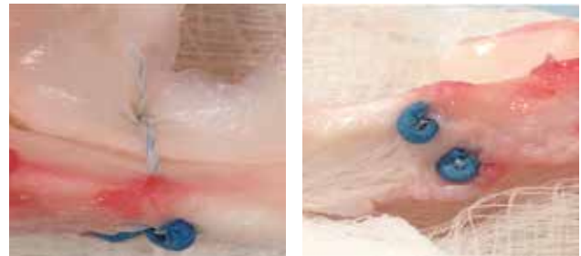
Figure 1 and 2 Vertical mattress stitch using the JuggerStitch knotless, all-suture device

The test location was Warsaw, IN and performed using an Instron materials testing machine (Instron, Canton, MA).