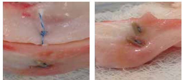
Figure 3 and 4 Vertical mattress stitch using the Ultra FAST-FIX device (Smith and Nephew)